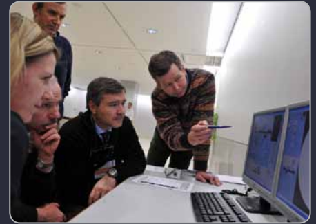
Images: Peter L. Reichertz Institute for Medical Informatics. Acknowledgment Markus Wagner, Michael Teistler

In co-operation with physicians from accident surgery and radiology the computer-based training system virtX was developed. virtX confronts the user with different exercises of BV adjustment and evaluates their execution and the results. These tasks can be created with the help of an authoring tool and can be accomplished by the trainee in different modes: a pure virtual mode and a combined virtual-real mode. In the pure virtual mode the user controls the virtual C-arm in a virtual operating theatre via the graphic-interactive virtX user interface. In the virtual-real mode however the position and orientation of a real C-arm are detected and mapped onto the virtual C-arm. At any time during the completion of an exercise the user can produce a close-to-reality, virtual radiograph built upon virtusMED and can control all parameters, like the positions of the apertures, X-ray intensity, etc.